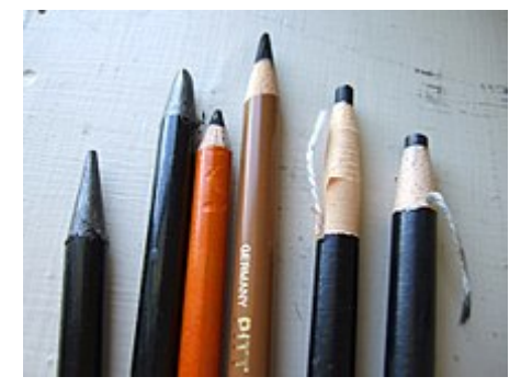
Two "woodless" graphite pencils, two charcoal pencils, and two grease pencils