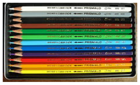
Coloured pencils (Caran d'Ache)