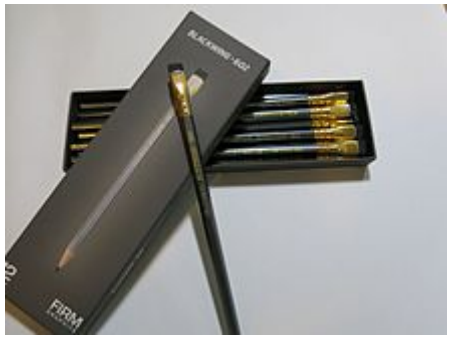
Palomino Blackwing 602 pencils

Around 1560,<sup>[20]</sup> an Italian couple named Simonio and Lyndiana Bernacotti made what are likely the first blueprints for the modern, wood-encased <u>carpentry pencil</u>. Their version was a flat, oval, more compact type of pencil. Their concept involved the hollowing out of a stick of <u>juniper</u> wood. Shortly thereafter, a superior technique was discovered: two wooden halves were carved, a graphite stick inserted, and the halves then glued together—essentially the same method in use to this day.<sup>[21]</sup>