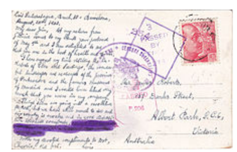
Obliteration by indelible pencil to censor mail in 1943

Unlike wax-based coloured pencils, these can be easily erased. Their main use is in sketching, where the objective is to create an outline using the same colour that other media (such as wax pencils, or watercolour paints) would fill<sup>[47]</sup> or when the objective is to scan the colour sketch.<sup>[48]</sup> Some animators prefer erasable colour pencils as opposed to graphite pencils because they don't smudge as easily, and the different colours allow for better separation of objects in the sketch.<sup>[49]</sup> Copy-editors find them useful too, as their markings stand out more than graphite but can be erased.<sup>[50]</sup>