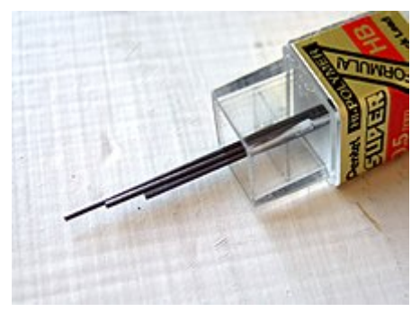
Lead for mechanical pencils

There are also pencils which use mechanical methods to push lead through a hole at the end. These can be divided into two groups: propelling pencils use an internal mechanism to push the lead out from an internal compartment, while clutch pencils merely hold the lead in place (the lead is extended by releasing it and allowing some external force, usually gravity, to pull it out of the body). The erasers (sometimes replaced by a sharpener on pencils with larger lead sizes) are also removable (and thus replaceable), and usually cover a place to store replacement leads. Mechanical pencils are popular for their longevity and the fact that they may never need sharpening. Lead types are based on grade and size; with standard sizes being 2.00 mm (0.079 in), 1.40 mm (0.055 in), 1.00 mm (0.039 in), 0.70 mm