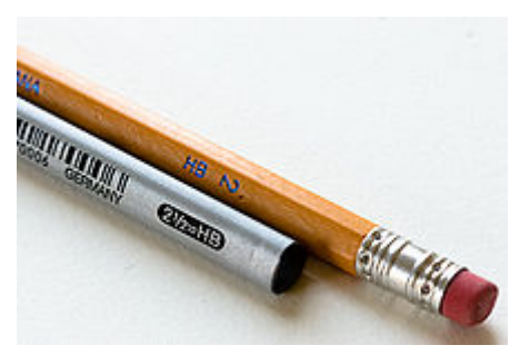
Two graphite pencils. Both are labelled "HB", but the numeric label differs between "2" and " 2\frac{1}{2} "

As of 2009, a set of pencils ranging from a very soft, black-marking pencil to a very hard, light-marking pencil usually ranges from softest to hardest as follows: